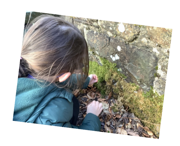
Science Week in Class Bray

To celebrate Science Week, Class Bray have participated in a variety of fun activities linked to the theme of 'Adapt and Change'. Our favourite activities were junk modelling an animal and playing camouflage caterpillars. In junk modelling, the children were asked to pick an environment and create an animal that has had to adapt to that environment; the children had to think about factors such as the temperature, how the animal would drink and even where they would shelter. In our game of camouflage caterpillars, we pretended to be caterpillars that had to hide from the predators and hide our caterpillar string. We then became hungry birds that were hunting the camouflaged caterpillars! The children voted that the green